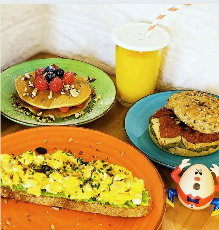
📍 O Ninho Family Bar