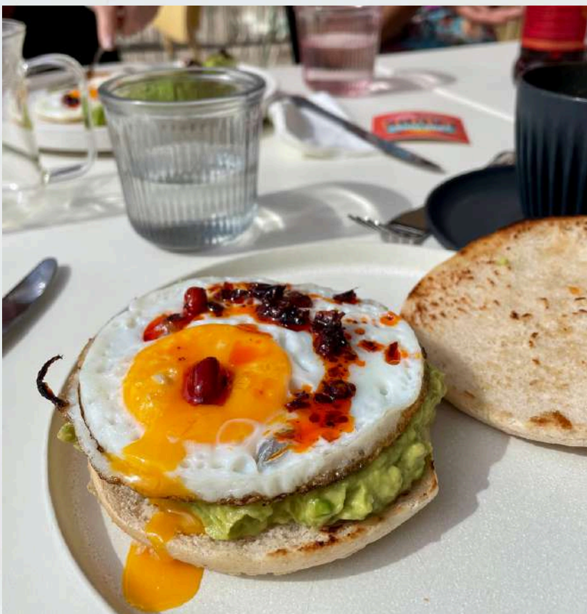
📍 Everyday People