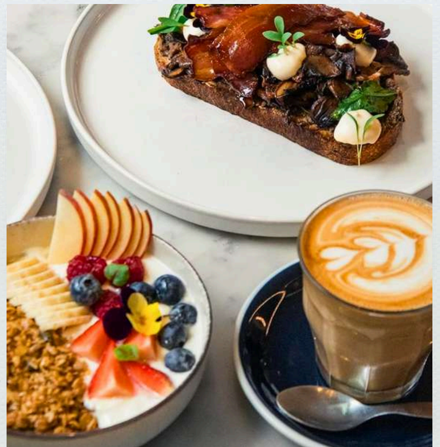
📍 Black and White Café