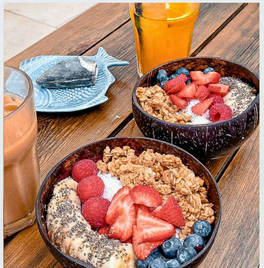
📍 Indigo bar