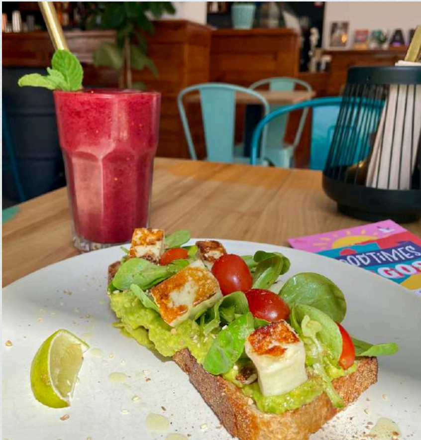
📍 Twin Fin